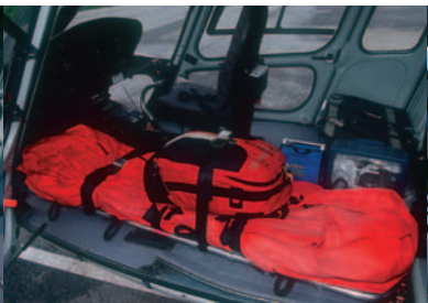
Emergency Medical Service kit