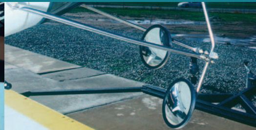
Electrical external mirror