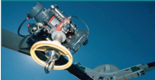
Air Equipment Electrical Hoist (136 kg / 300 lb)