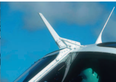
Cable cutter for wire strike protections

(Optional equipment not displayed below: Pilot & Co-pilot windshield wiper, Second battery kit, Air conditioning system, Sand prevention filter,...).