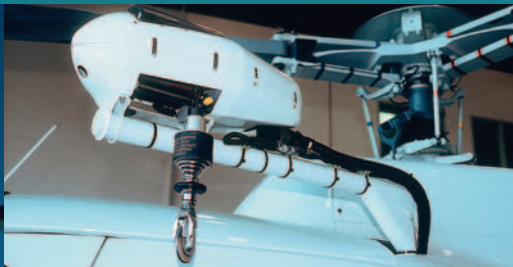
Breeze Electrical Hoist (204 kg / 450 lb)