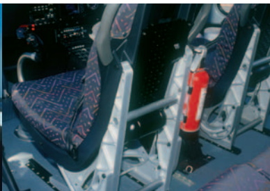
Energy absorbing seats