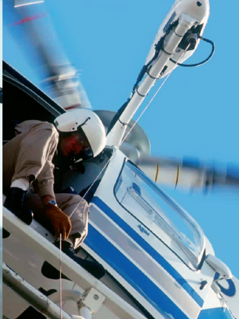
Search & Rescue