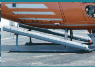
Emergency Floatation system