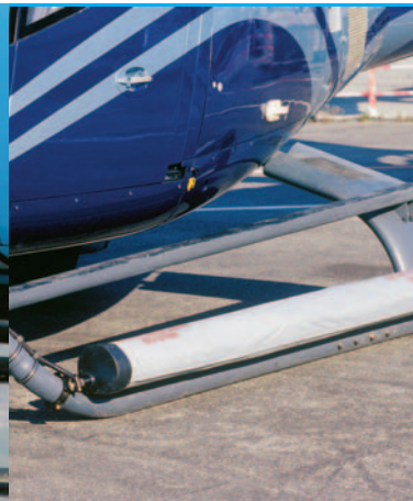
Emergency floatation gear