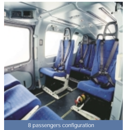
8 passengers configuration