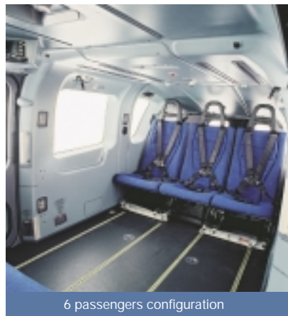
6 passengers configuration