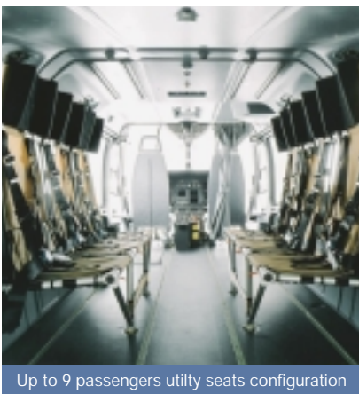
Up to 9 passengers utility seats configuration