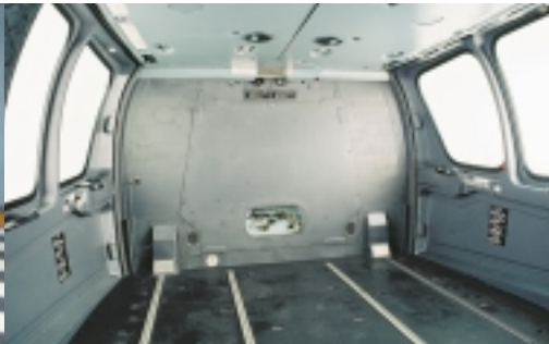
Cabin volume : 6,66m 3 (235 cu.ft)