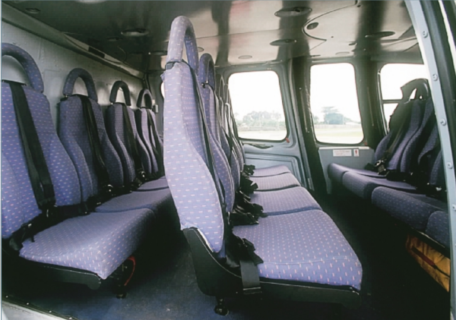
12 high back seats with 4 point harnesses - Club configuration