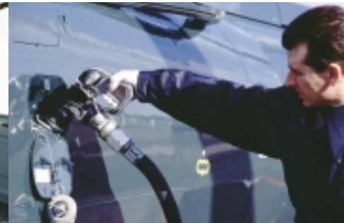
One side refuelling